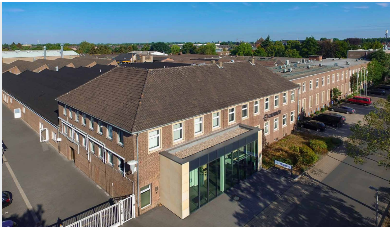
OLBRICH Headquarters Bocholt, Germany

Scan this QR-Code for discovering the technical centre in Bocholt, Germany