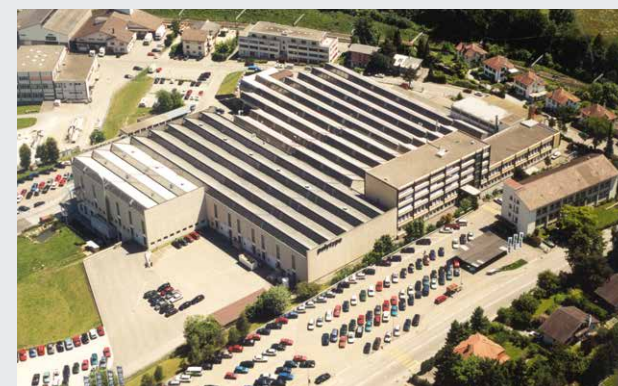
It's brand Polytype Converting ® in Hamburg, Germany & Fribourg, Switzerland